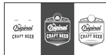
Color-separated WHITE layer of this file.

Turning on "Overprint preview allows you to see this example as well"