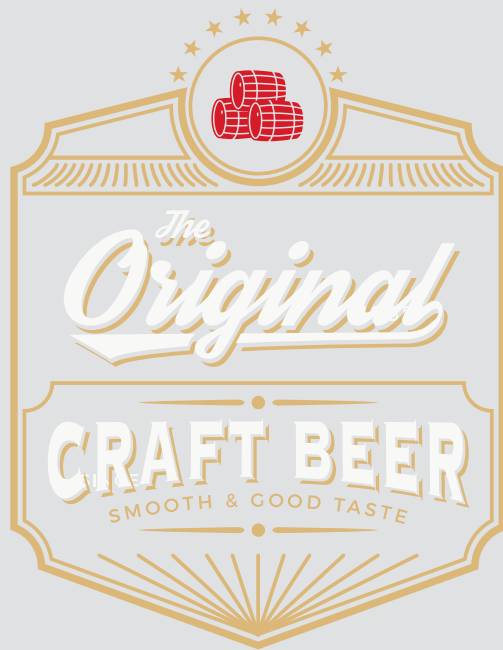
Transparent background, white text, metallic shield