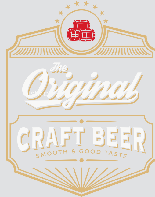
Transparent background, white text, white under shield.