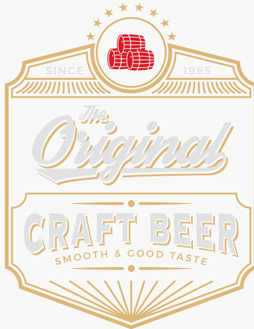
White background, transparent text, metallic shield