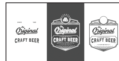
Color-separated WHITE layer of this file.

Turning on "Overprint preview allows you to see this example as well"